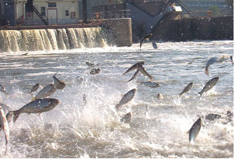
Silver carp jumping at Peoria Dam in Illinois.

Silver carp are a hazard for boaters. The vibration of boat propellers can make Silver carp jump up to three metres out of the water. Boaters and water-skiers in areas of the Mississippi and Illinois rivers have been seriously injured by jumping fish.