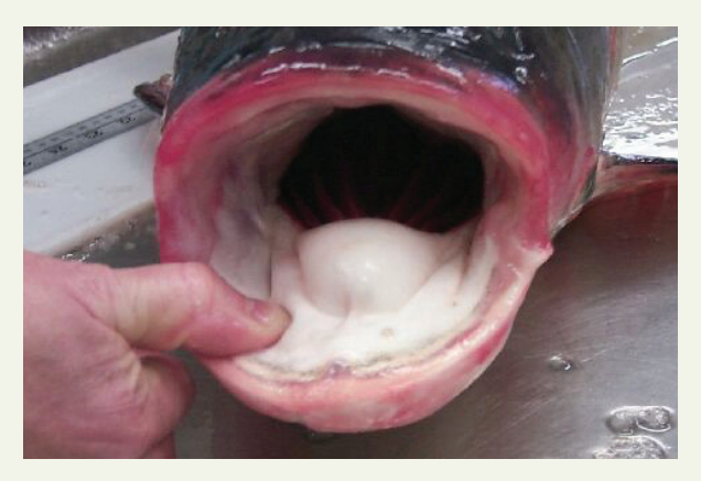
Bighead and Silver carp have large toothless mouths.