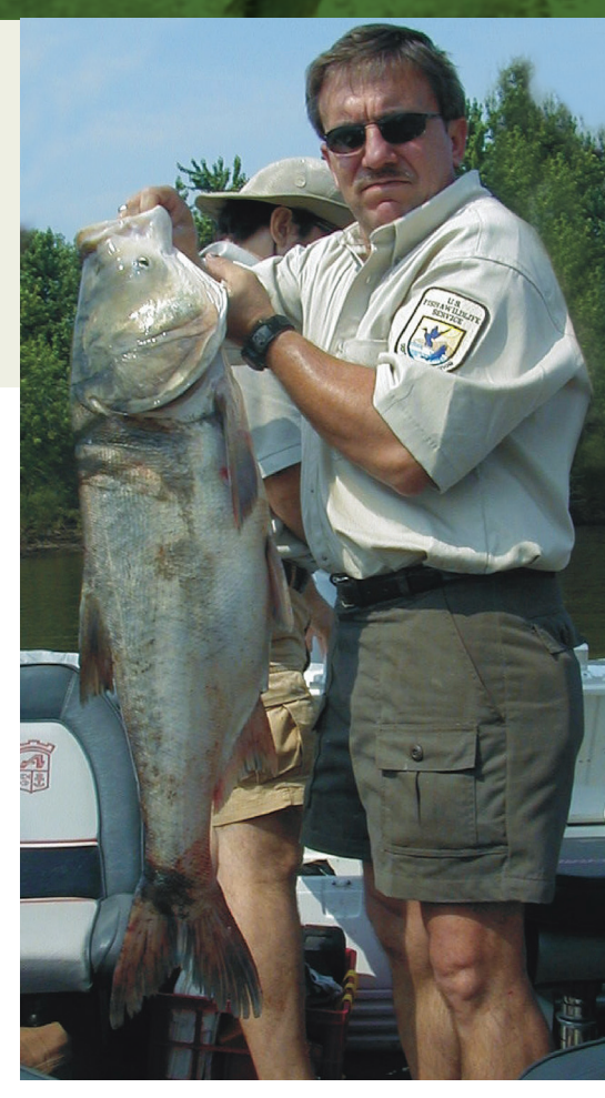
US Fish & Wildlife Service officer with Bighead carp from Illinois River.

Asian carps prefer cool to moderate water temperatures, like those found near the shores of the Great Lakes. If Asian carps become established in Ontario waters, they could potentially eat the food supply that our native fish depend on and crowd them out of their habitat. The decline of native fish species could damage sport and commercial fishing in Ontario, which brings millions of dollars a year into the province's economy.