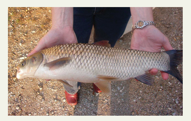
Grass carp.