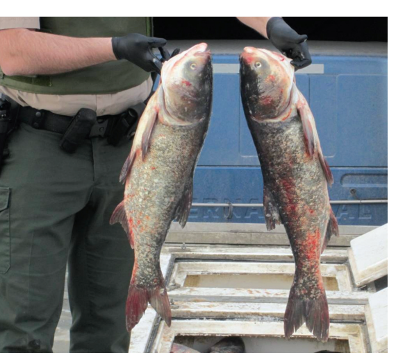
OMNR conservation officer seizes Bighead carp at Canada/U.S. border.