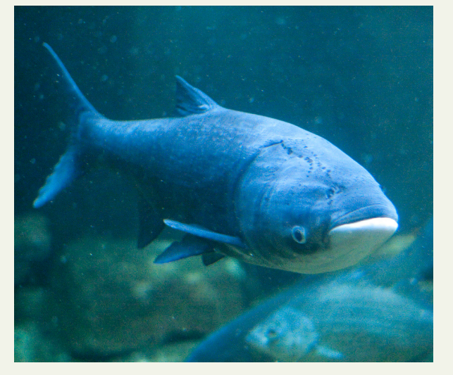
Bighead carp.