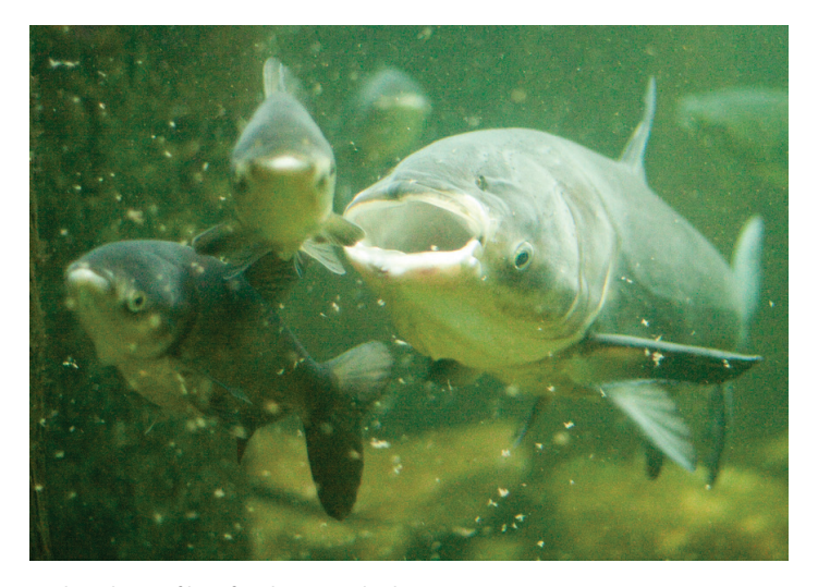
Bighead carp filter feeding on plankton.