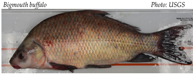
Smallmouth buffalo